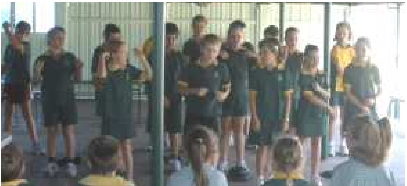
Practising for the end of year Awards Night and Concert