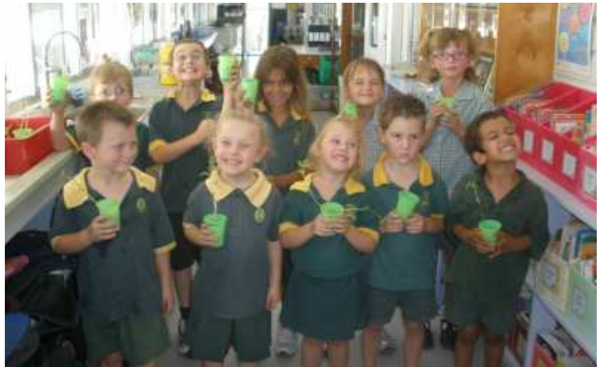
P-3 students with their Science Experiments